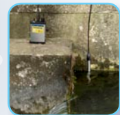
Open channel flow